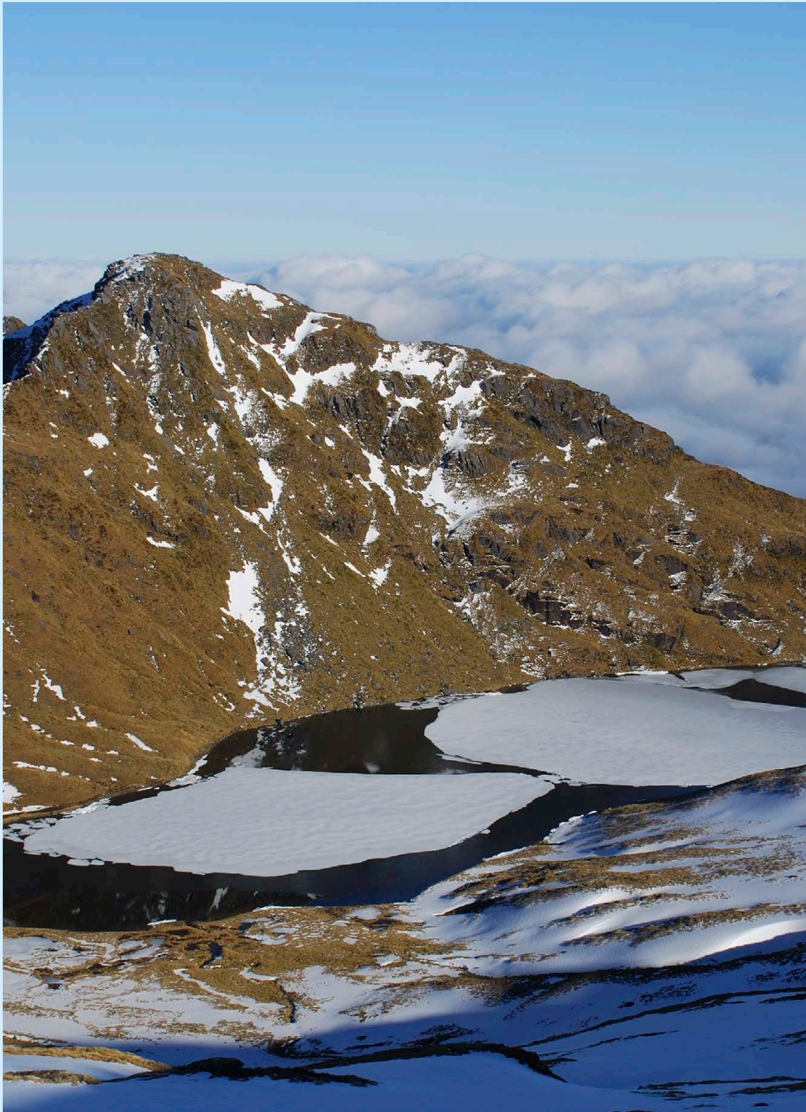
LAKE GREANEY, ONE OF THE TWO PRISTINE LAKES FROM WHICH ALPINE PURE IS SOURCED